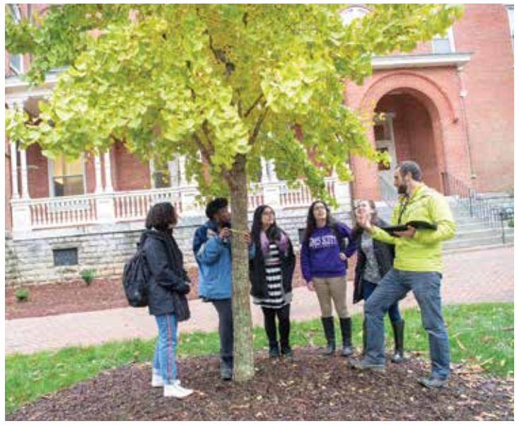
Figure 2. The Agnes Scott Arboretum of Agnes Scott College in Decatur, Georgia, U.S.A. With more than 2,000 trees, the arboretum is an extension and reflection of their liberal arts curriculum (Accredited Level I). Educational outreach is an important function of most arboreta.

ArbNet was established on Arbor Day, April 29, 2011, by The Morton Arboretum in partnership with the American Public Gardens Association and Botanic Gardens Conservation International (BGCI). In its first eight years, ArbNet has built capacity for smaller gardens and nontraditional arboreta, like cemeteries, municipalities, and retirement communities, through programs like a Capacity Building Grant, the BGCI/ArbNet Partnership Program, and a portal of online resources. ArbNet also administers an arboretum accreditation program, which recognizes four different levels of professionalism and capacity in tree-focused gardens. ArbNet is the only international professional network and accreditation program specific to arboreta. The strength of the ArbNet network is its diversity-from major world-renowned arboreta (Figure 5), to smaller, lesser known but growing