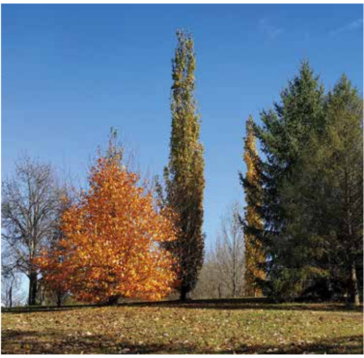
Figure 13. Starhill Forest Arboretum has over 1000 species in its collection. Shown here are Prince of Darkness Beech, fastigiated oaks, and Picea asperata.

can visit the ArbNet website (www.arbnet.org). The website contains listings of all accredited arboreta by level of accreditation and has sample applications to assist organizations that are interested in how to apply for their own accreditation.