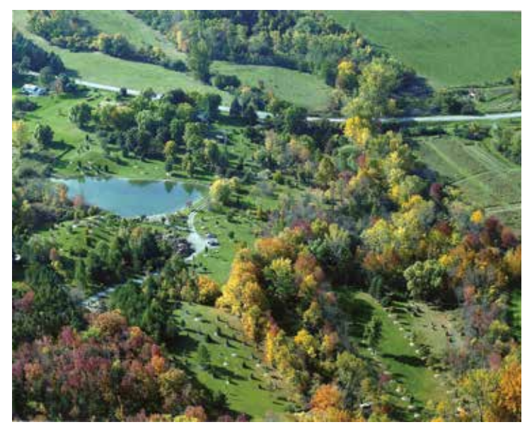
Figure 6. The woody plant collection of Draves Arboretum has expanded to over 700 plant species.

Woodlawn Cemetery became a Level II Arboretum in 2017. The site is well-suited to this status, as it sits on over 400 acres with 6500 trees comprising over 145 different tree species and cultivars in densely populated New York City (Figure 9). The site is a National Historic Landmark with a mission of conservation, preservation,