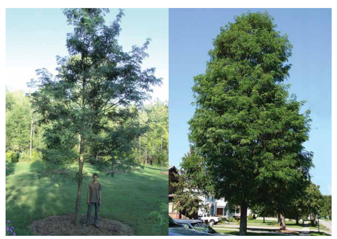
Figure 7. Street Keeper<sup>™</sup> honeylocust was introduced by Tom Draves and is growing in Draves Arboretum (left). Parent plant of Street Keeper<sup>™</sup> honeylocust in situ (right).