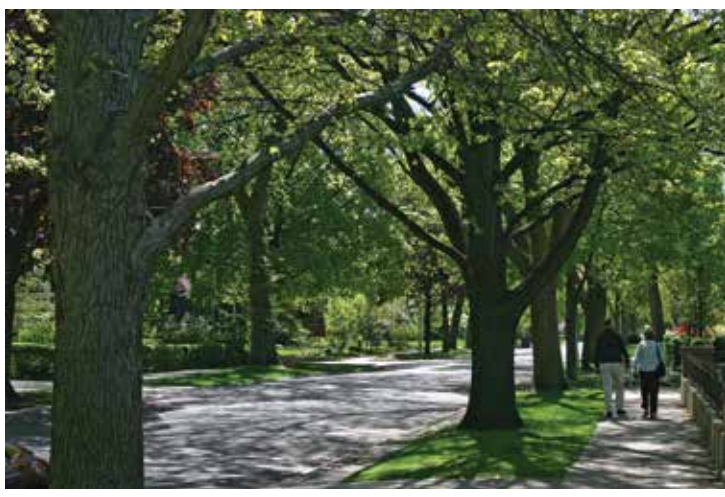
Figure 4. Street trees as part of an arboretum in the Village of Oak Park, Illinois, U.S.A. The Village has more than 20,000 trees representing more than 130 different species and varieties (Accredited Level II).