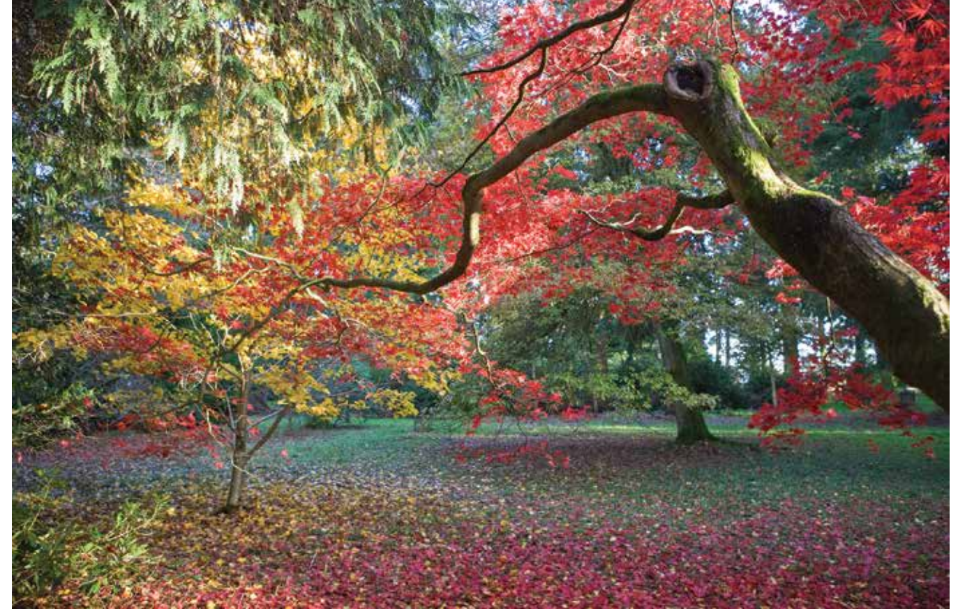
Figure 1. Westonbirt, The National Arboretum, Tetbury, U.K., Acer Glade. (ArbNet accredited Level IV). ArbNet is an international program.