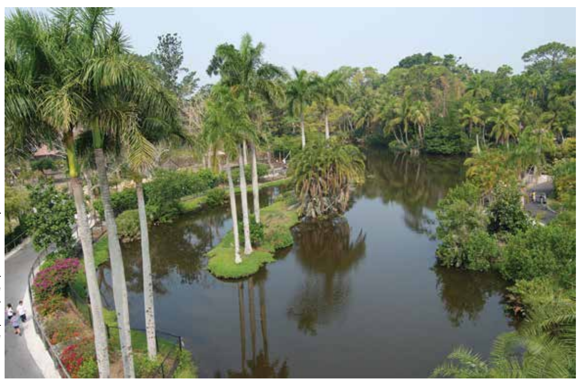
Figure 3. Naples Zoo at Caribbean Gardens, Naples, Florida, U.S.A. A zoo nestled within a garden and arboretum. Its plantings include multiple mature Ficus species (F. altissima, F. lutea, F. benghalensis, F. macrocarpa, F. microcarpa [nitida], F. sycamorus) throughout the garden (Accredited Level I).

gardens. These arboreta provide guidelines, models, expertise, and inspiration for others so that the entire network can build capacity, collaboration, and best practices for tree-focused gardens around the world. ArbNet's growing community of nontraditional arboreta is reaching new audiences that traditional arboreta wouldn't readily access, broadening public awareness of the importance of trees.