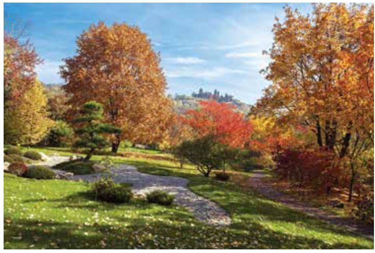
Figure 5. A Japanese garden in the Prague Botanical Garden in Prague, Czech Republic, with a collection of 6540 trees. There are only 28 Level III accredited arboreta in the world (Accredited Level III).