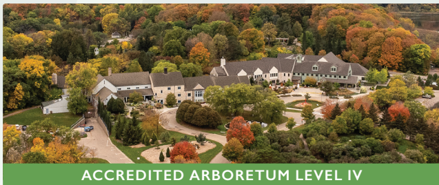
ACCREDITED ARBORETUM LEVEL IV

Arboretum De Nieuwe Ooster, Amsterdam, Netherlands