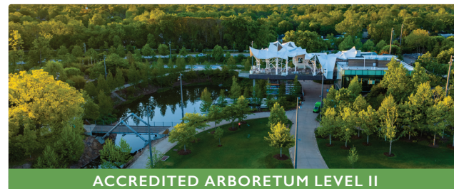
ACCREDITED ARBORETUM LEVEL II

Arderne Gardens, Cape Town, South Africa