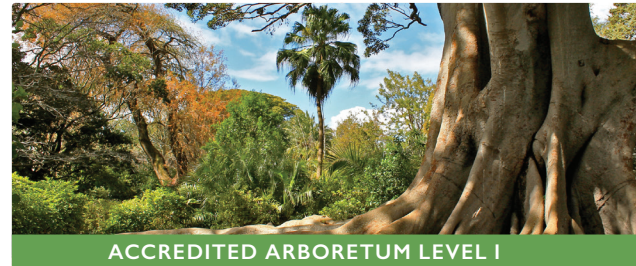
ACCREDITED ARBORETUM LEVEL I

Arderne Gardens, Cape Town, South Africa