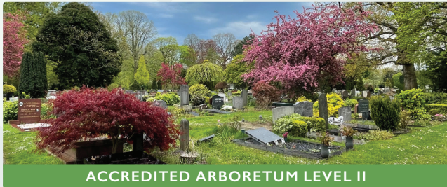
ACCREDITED ARBORETUM LEVEL II

Arboretum De Nieuwe Ooster, Amsterdam, Netherlands